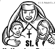
St. Katharine Drexel